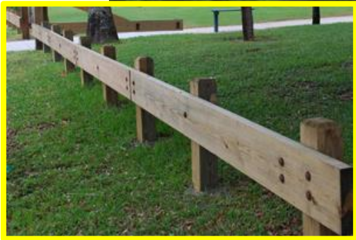
Figure 2: Asbury Drive at Lane Avenue realignment with decorative timber guardrail

The Riverside Drive shared use path is being designed as a 10-foot-wide concrete path consistent with the Lane Avenue connection. The path would continue onto Trabue Road, connecting with the Trabue Road Bridge that will be reconstructed in 2024 to include a 12-foot shared use path. We have investigated elevations, grade changes and utilities to ensure that this portion could be constructed with minor right-of-way acquisition.