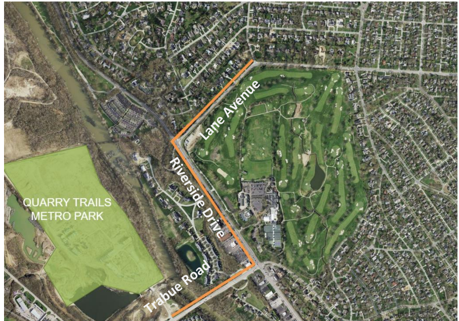
Figure 1: Proposed shared use path on Lane Ave, Riverside Drive, and Trabue Road

As part of these connections, the City is proposing two projects that would install a concrete shared use path on Lane Avenue from Riverside Drive to Asbury Road (2023) and on Riverside Drive from Lane Avenue to Trabue Road (2024). These two projects would be